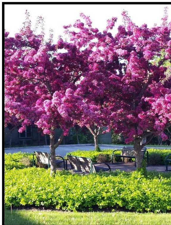
SUMMER BLOOMING AT A.R. GOUDIE